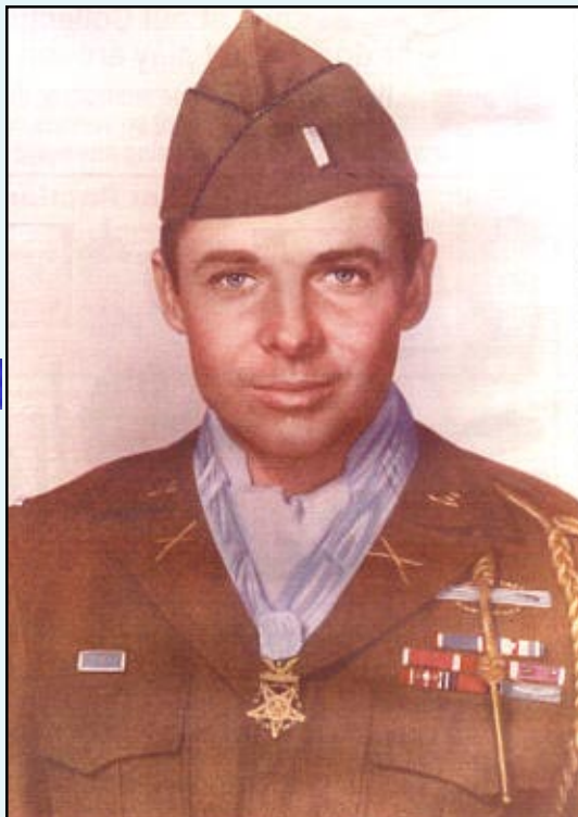
June 20, 1924 - May 28, 1971 Buried at Arlington National Cemetery