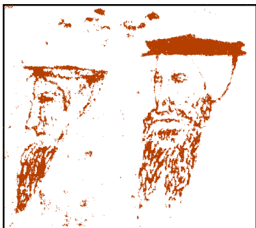
John Calvin as sketched by one of his Geneva Academy students.